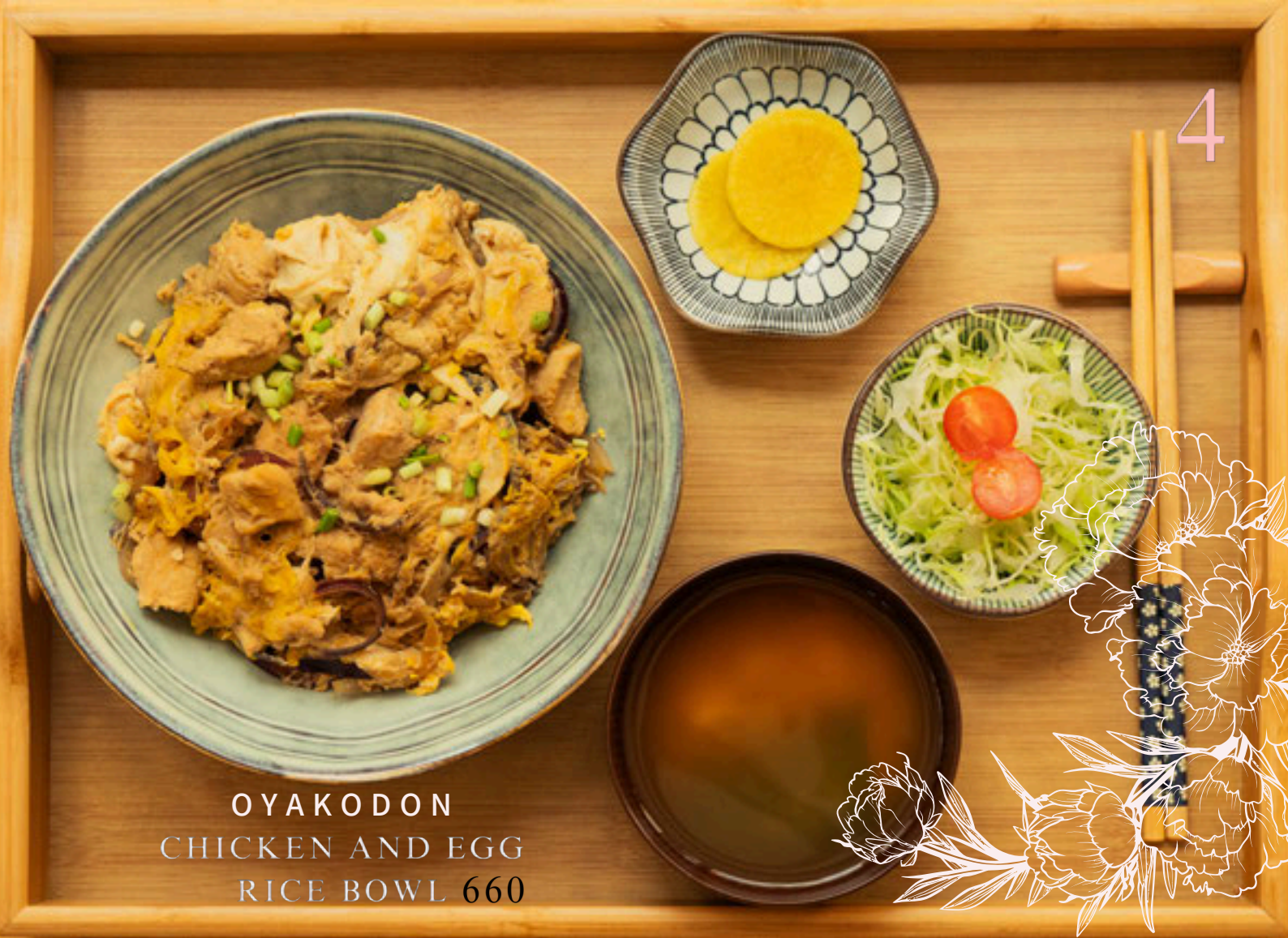
OYAKODON CHICKEN AND EGG RICE BOWL 660