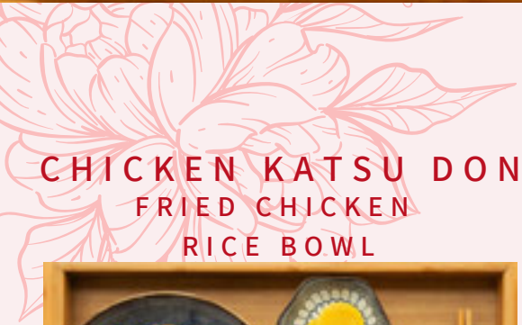
CHICKEN KATSU DON FRIED CHICKEN RICE BOWL