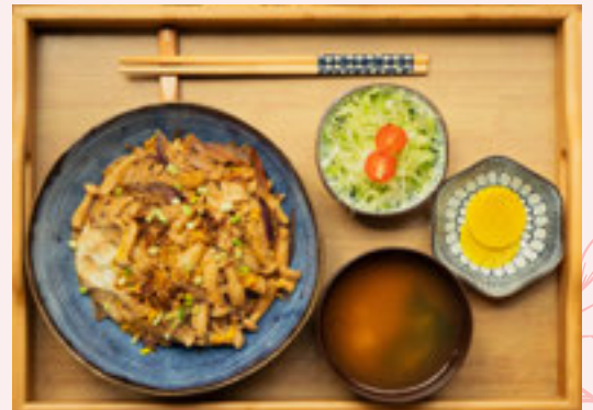
SERVED WITH RICE, SALAD, RADISH PICKLE AND MISO SOUP 660