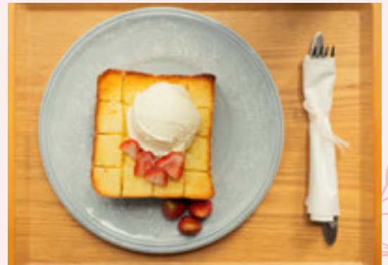
BUTTER TOAST WITH FRESH STRAWBERRIES AND CREAM 300