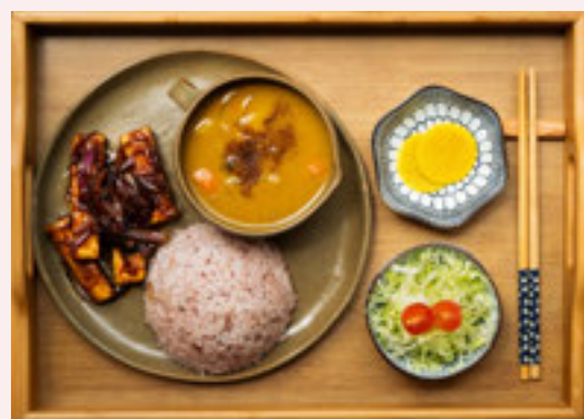
SERVED WITH TOFU, RICE, SALAD AND RADISH PICKLE 600