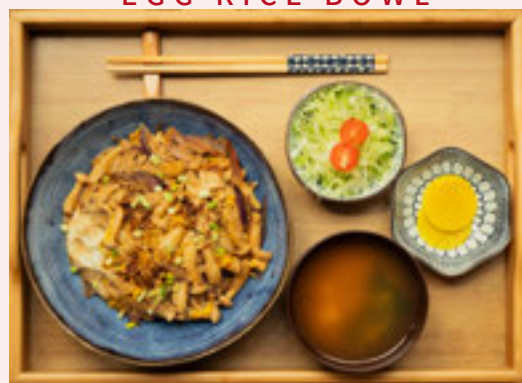
SERVED WITH RICE, SALAD, RADISH PICKLE AND MISO SOUP