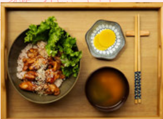
SERVED WITH RICE, MISO SOUP AND RADISH PICKLE 660