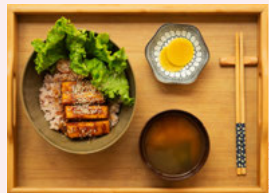
SERVED WITH RICE, MISO SOUP AND RADISH PICKLE 600