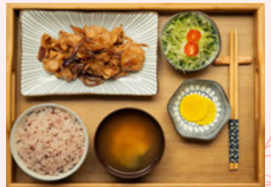
SERVED WITH PORK, RICE, SALAD, RADISH PICKLE AND MISO SOUP 660