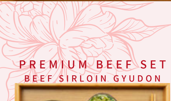
PREMIUM BEEF SET BEEF SIRLOIN GYUDON