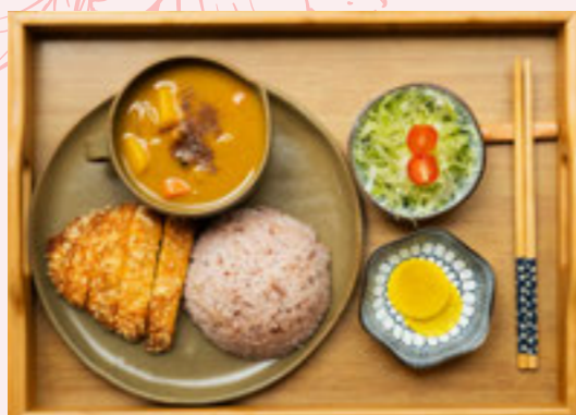
SERVED WITH CHICKEN KATSU, RICE, SALAD AND RADISH PICKLE 660