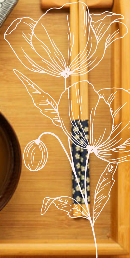
TOFU TERIYAKI BOWL 600