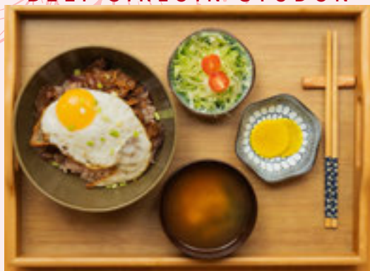
SERVED WITH RICE, SALAD AND RADISH PICKLE