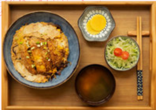
SERVED WITH RICE, SALAD, RADISH PICKLE AND MISO SOUP 660