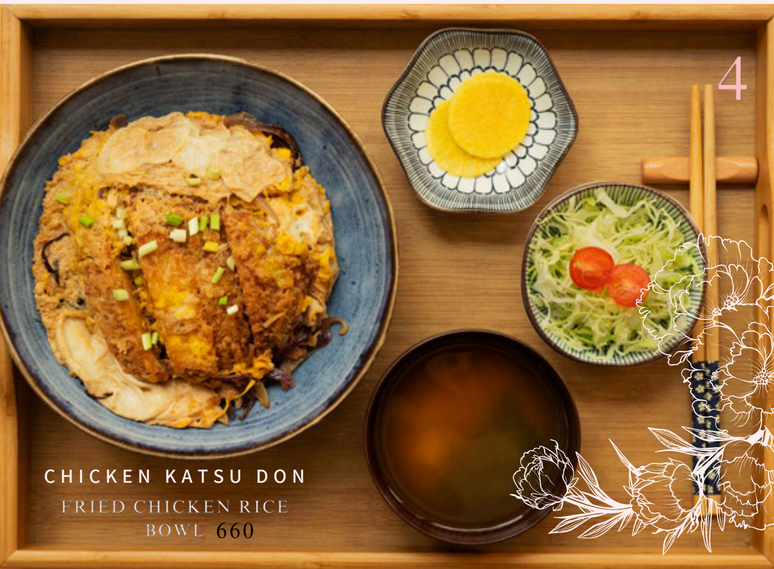
CHICKEN KATSU DON FRIED CHICKEN RICE BOWL 660