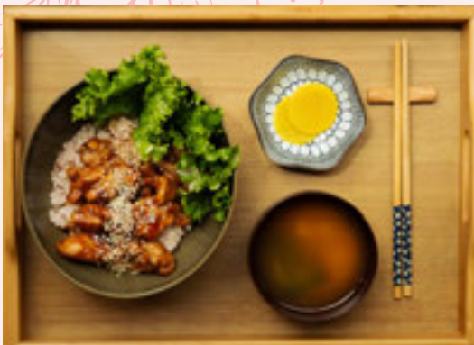
SERVED WITH RICE, MISO SOUP AND RADISH PICKLE 660