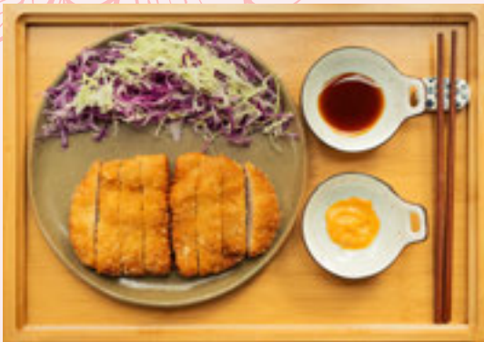
FRIED CHICKEN CUTLET 550